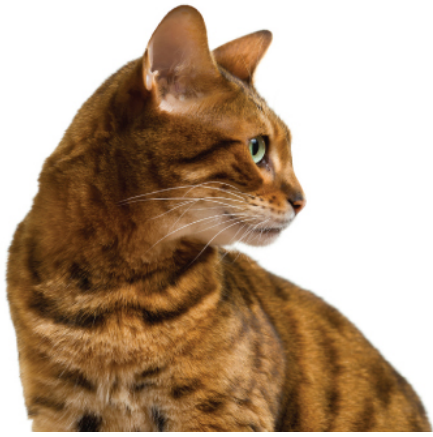
Start of field